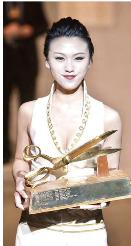
Winning the Golden Shears Award, 2011

The amount of time and skill that goes into making whisky and tailoring is quite different from most jobs. They're very specialized industries and you really need