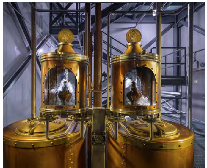
Clockwise from top left: Michter's Shively Distillery; Michter's exterior shield; the fermenters at Shively Distillery; still tail boxes; Michter's US*1 Small Batch Bourbon labels.