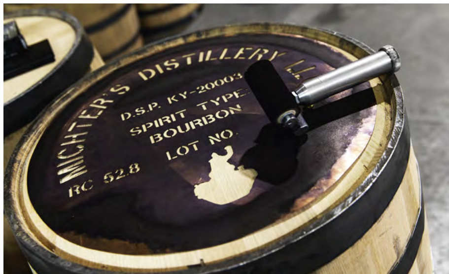
A Michter's bourbon barrel, ready to be stenciled.

within the structure of the wood will break down at different temperatures and different amounts of time so that will unlock your extractives. There are hundreds of different extractives in the wood leading to many toasting profiles.